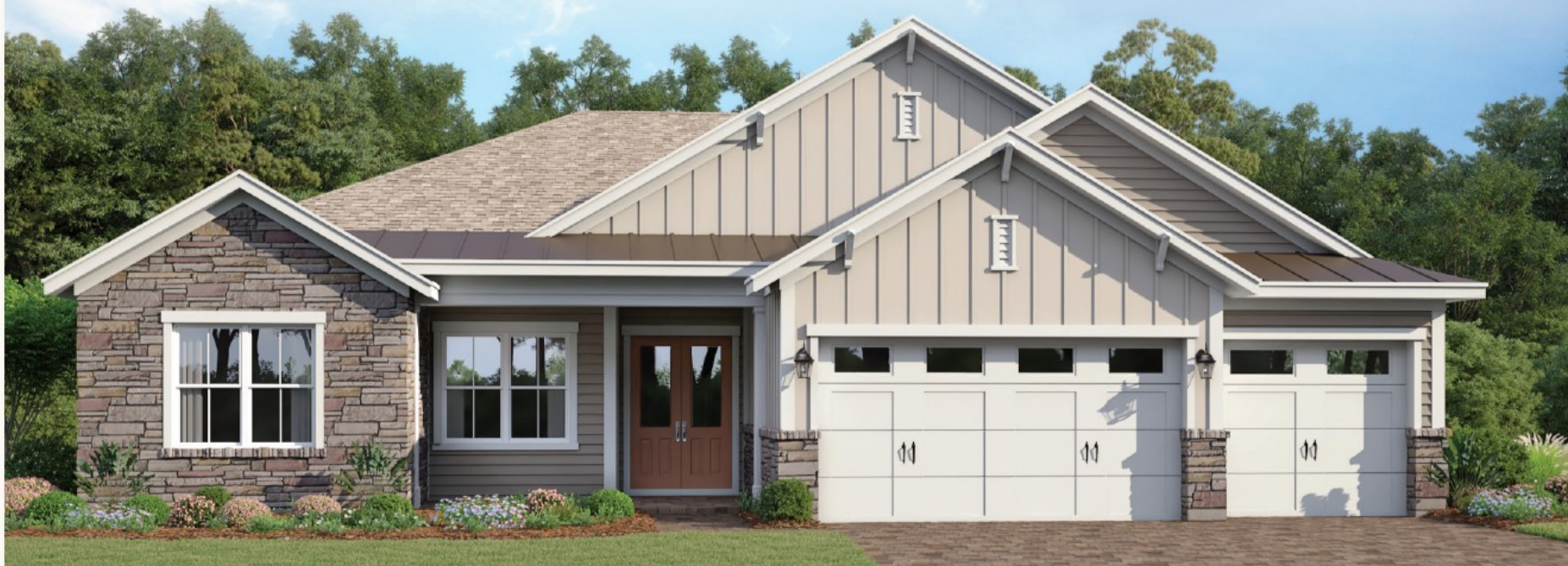
MODERN FARMHOUSE ENHANCED